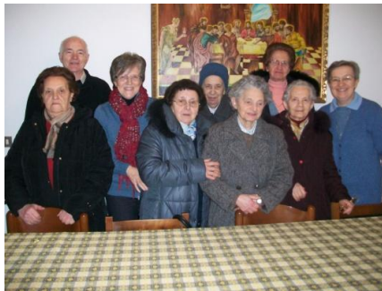
The President with the Company of Vicenza, December 17, 2012